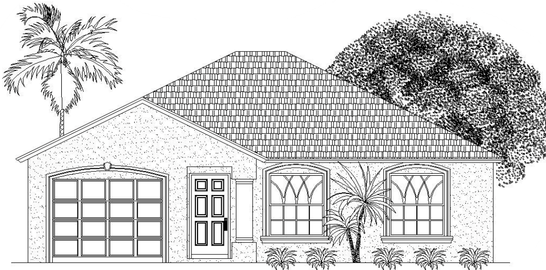
ELEVATION : A