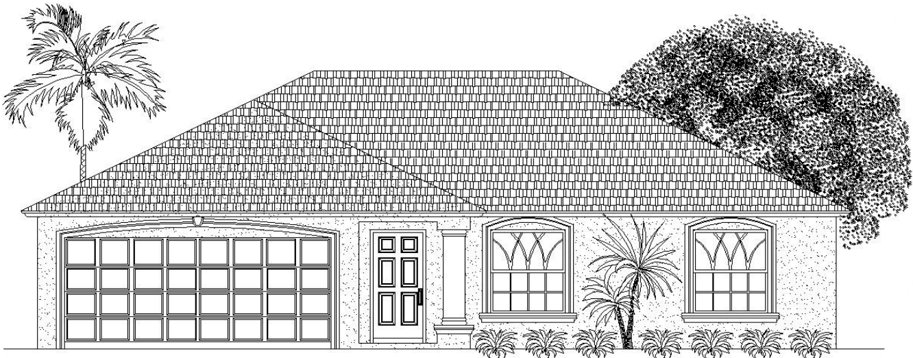
ELEVATION : B

Because we constantly improve our homes, floor plans are subject to change. We reserve the right to change designs, features, materials & pricing without prior notice. Room dimensions are approximate and may be based