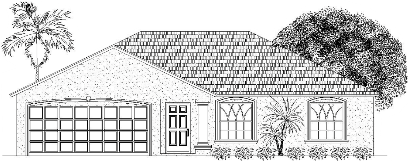
ELEVATION : A