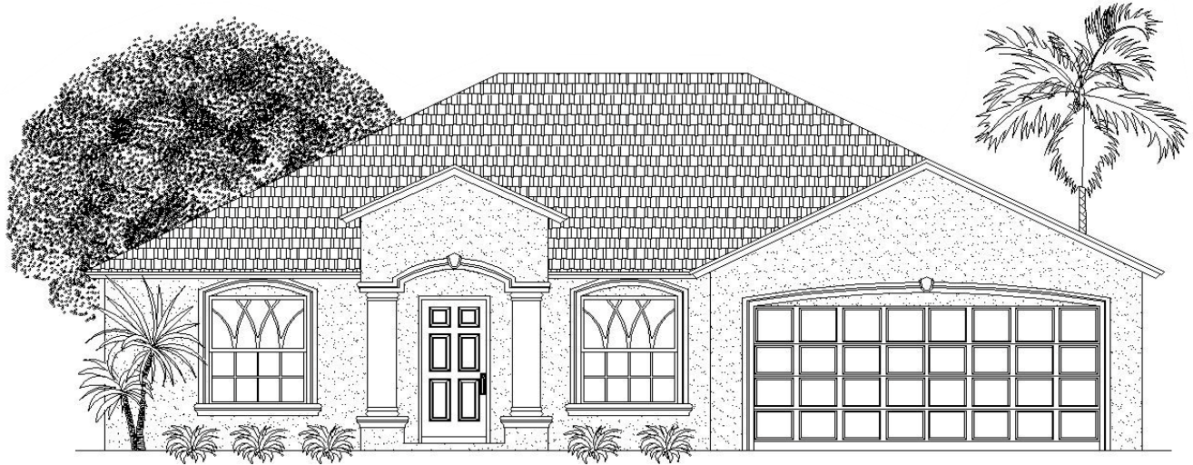
ELEVATION : A