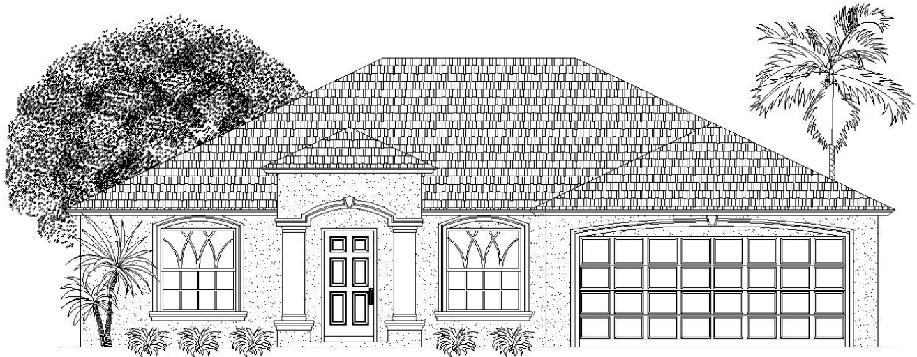
ELEVATION : B

Because we constantly improve our homes, floor plans are subject to change. We reserve the right to change designs, features, materials and pricing without prior notice. Room dimensions are approximate and may be based on outside dimensions.