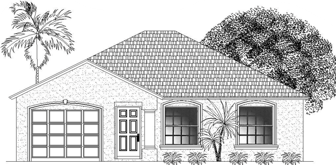
ELEVATION : A