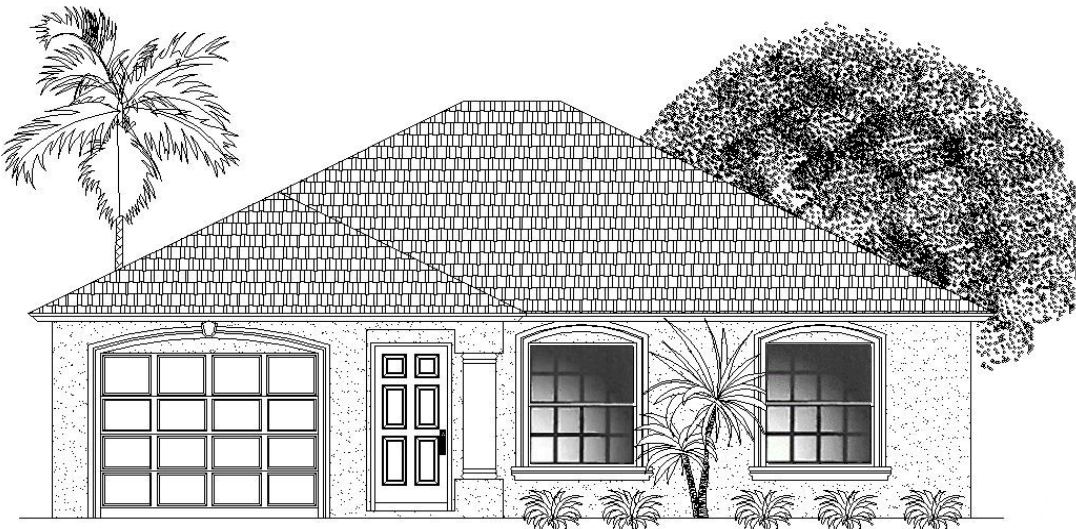
ELEVATION : B

Because we constantly improve our homes, floor plans are subject to change. We reserve the right to change designs, features, materials & pricing without prior notice. Room dimensions are approximate and may be based on outside dimensions.