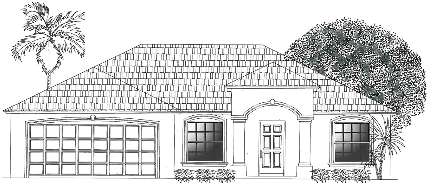
ELEVATION : B

Because we constantly improve our homes, floor plans are subject to change. We reserve the right to change designs, features, materials & pricing without prior notice. Room dimensions are approximate and may be based on outside dimensions.