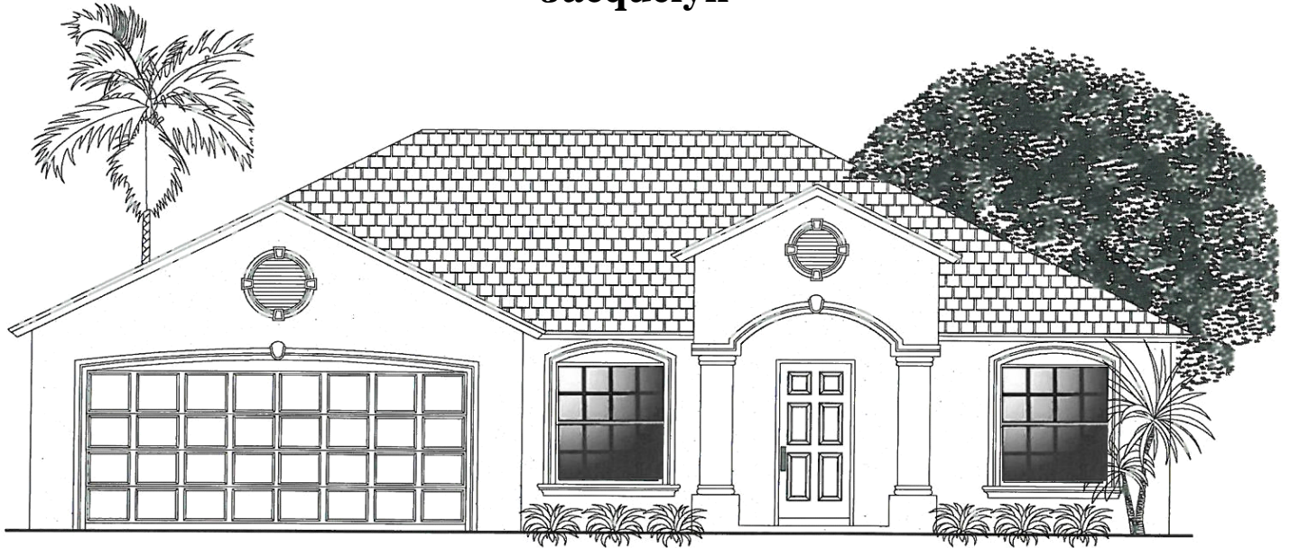
ELEVATION : A