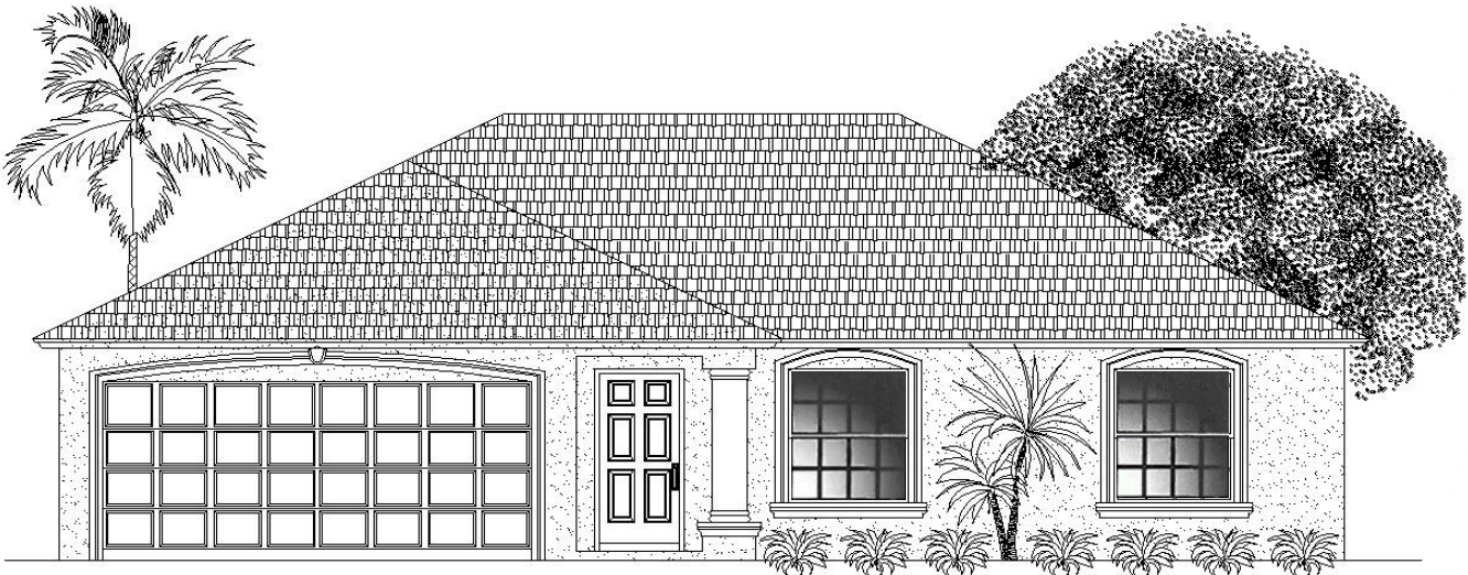
ELEVATION : B

Because we constantly improve our homes, floor plans are subject to change. We reserve the right to change designs, features, materials & pricing without prior notice. Room dimensions are approximate and may be based on outside dimensions.