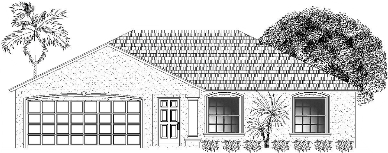
ELEVATION : A