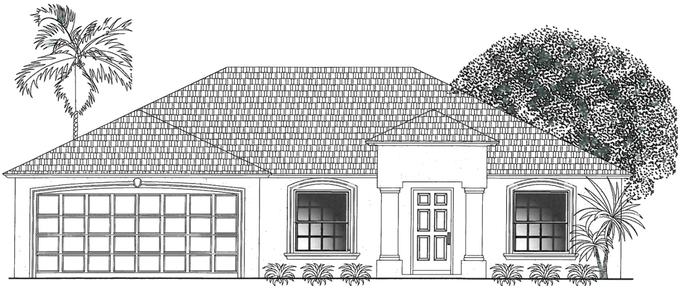
ELEVATION : B

Because we constantly improve our homes, floor plans are subject to change. We reserve the right to change designs, features, materials and pricing without prior notice. Room dimensions are approximate and may be based on outside dimensions.