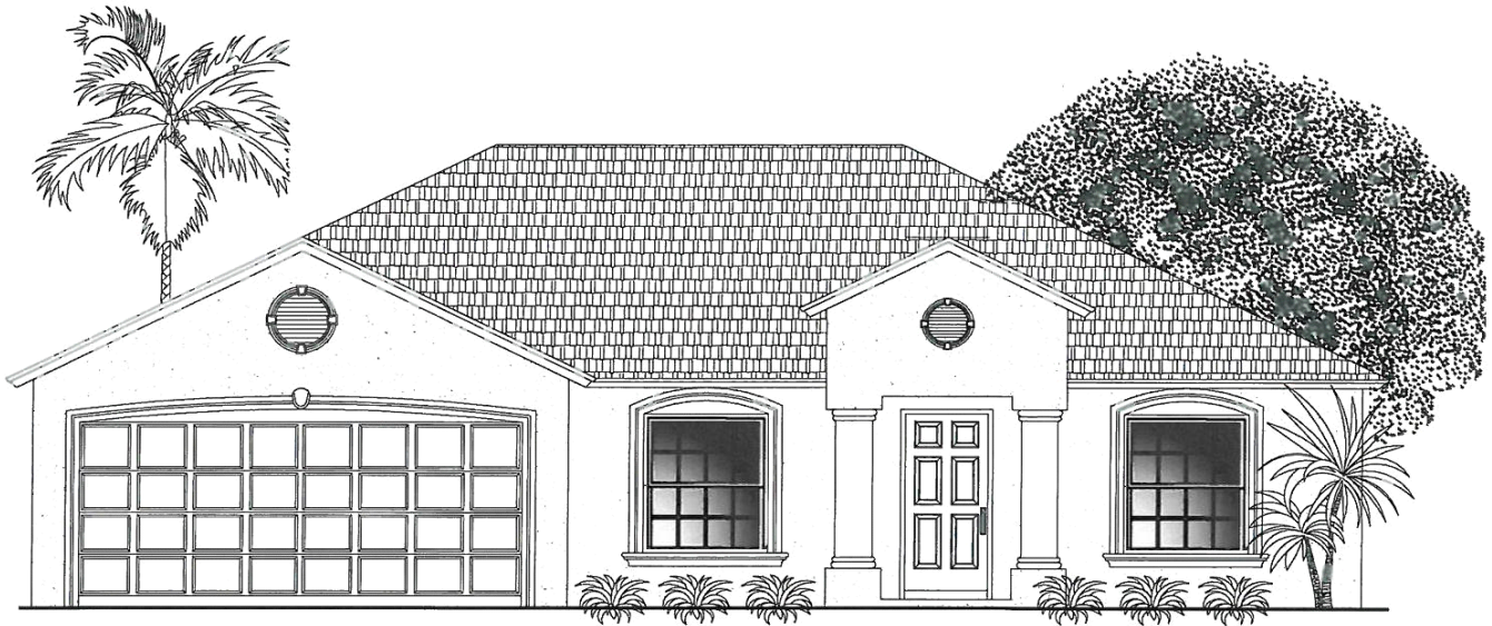
ELEVATION : A