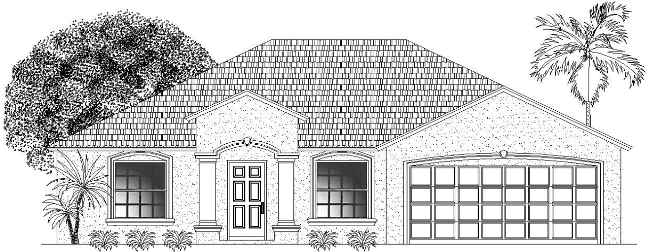
ELEVATION : A