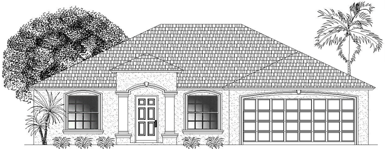
ELEVATION : B

Because we constantly improve our homes, floor plans are subject to change. We reserve the right to change designs, features, materials and pricing without prior notice. Room dimensions are approximate and may be based on outside dimensions.